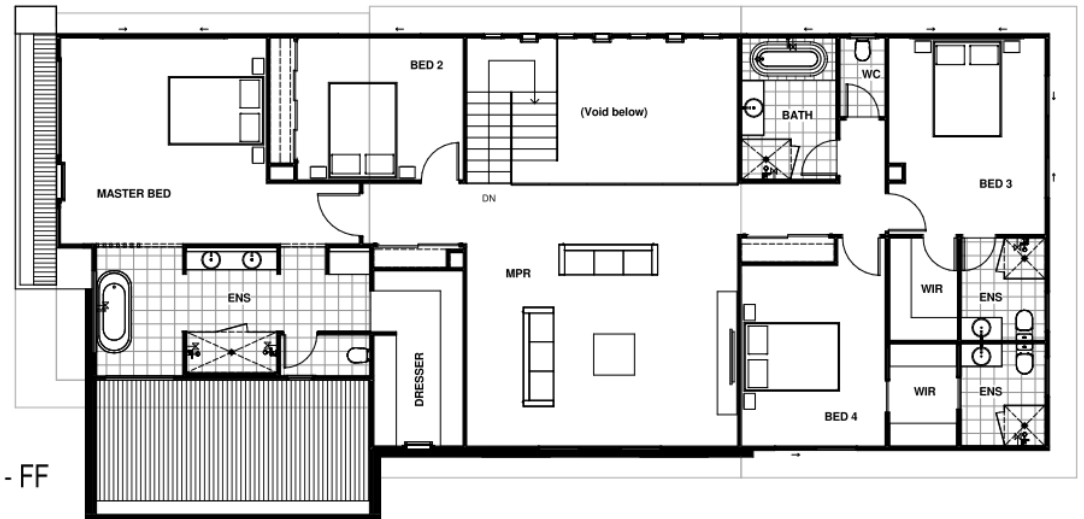
Sales Plans - FF